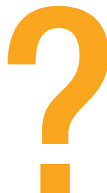
YOUR FIELD OF APPLICATION